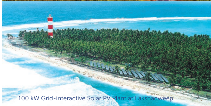
100 kW Grid-interactive Solar PV Plant at Lakshadweep