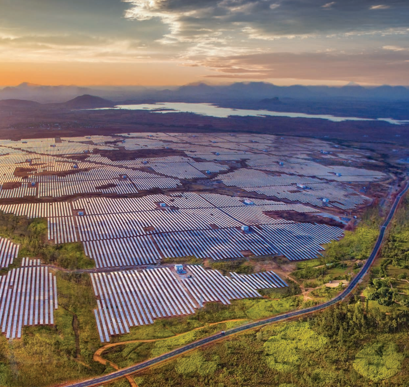
NTPC 5x50 MW solar PV plant at Kadiri (Andhra Pradesh)- 50 MW EPC by BHEL