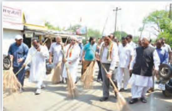
Cleanliness drive in Shastri Market, Piplani, BHEL, Bhopal

BHEL-Haridwar: Becoming a part of this noble campaign, the Executive Director initiated the drive for cleaning the entire factory premises under the banner of "Swachh BHEL - Swachh Bharat". In addition, multi-utility saplings were planted at the community center by CSR group of the unit. Members of BHEL Ladies Club also joined hands in cleaning the area. The shopkeepers also joined BHEL employees in cleaning shopping centre complex at Sector - 1.