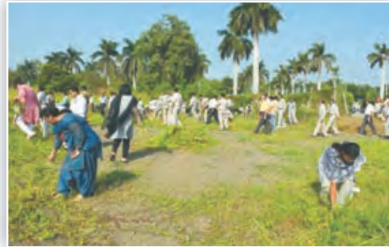
BHEL employees weeding out wild grass