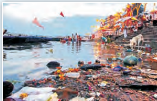
Dumping of sewage and solid wastes in the Ganges