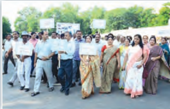
Rally by BHEL-Jhansi employees