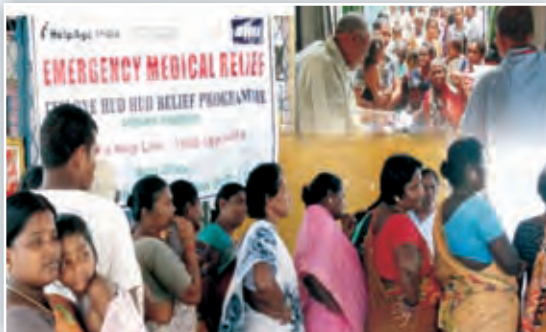
Emergency health camp for the Hud-Hud affected people