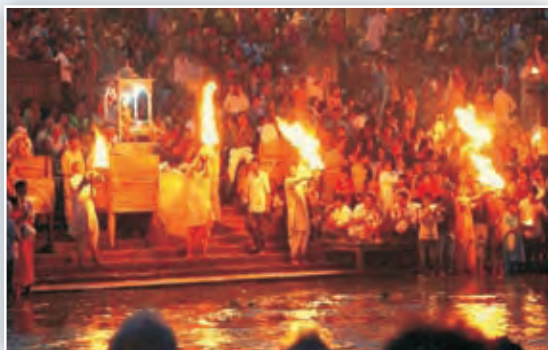
Devotees performing aarti at one of the ghats of Holy Ganges

G anga, the name that has been associated with purity and sanctity has been worshipped in India for centuries and has been a home to great dynasties which flourished along its banks. Millions of people depend on it for their daily needs in 11 states and it supports a huge ecological system within itself. Some studies suggest that the Ganga retains more oxygen than its typical comparable rivers, thus giving it a self-cleansing property of destroying disease causing bacteria. The holy towns of Haridwar, Allahabad, Varanasi, Kanpur and Unnao are located along its banks, which attract millions of pilgrims coming all round the year for a holy dip in the sacred river.