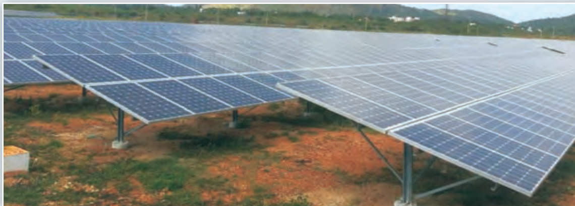
Solar panels of the 5 MW Solar Photo Voltaic (SPV) plant at BAP, Ranipet

For BHEL, sustainability is about achieving prosperity by balancing social equity and staying within the tolerable limits / capacity of the environment. At BHEL, we believe in doing business in a sustainable manner that extends across the spheres of our Business strategy, environmental action, social support and governance. The relationship between the company and its products, employees, customers and the society is - to use the unavoidable metaphor - like 'a river, the deeper it gets the less noise it makes'. It has been just a natural extension of the way BHEL saw itself and its responsibility. For almost fifty years of its existence, company has been leveraging technology and innovation for providing products, systems and services to its customers and enabling them to use resources with better efficiency and productivity which is also evident from its Mission Statement – "Providing