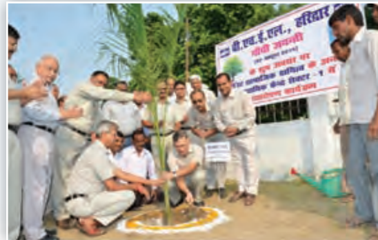
BHEL-Haridwar employees planting saplings