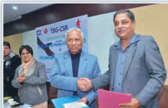
Signing of MoU between BHEL-TBG, Noida and Hemophilia Federation (India) for support to Hemophilic patients