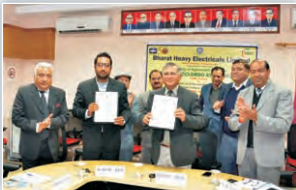
Signing of MoU between BHEL-Haridwar & FICCI for installation of 25 clusters of Bio-digester toilets on the banks of Ganges