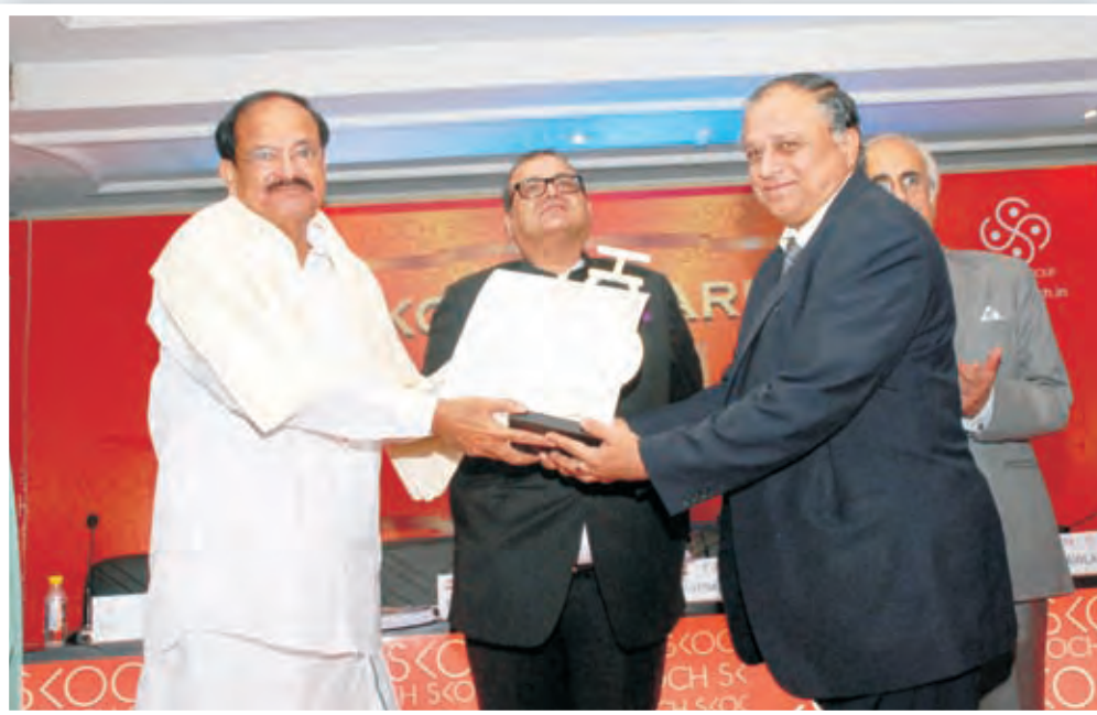
Hon'ble Union Minister, Shri M. Venkaiah Naidu presenting Skoch Order of Merit Award for best CSR project "Vision to all... BHEL's Call" towards eradication of corneal blindness to Shri B. Prasada Rao, CMD, BHEL