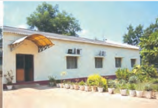
View of Kakatiya Site office – PSSR (before and after its painting)