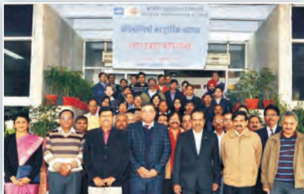
Participants of the Inter-Unit CSR Meet with Director (HR) and ED (HR & CC)