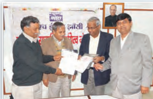
Signing of agreement between BHEL, Jhansi and Agastya International Foundation for Mobile Science Lab