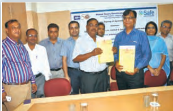
MoU signing between BHEL-PSWR, Nagpur & Safe Water Network (India) for installation of 10 R.O. Plants (iJal stations) in villages located in the vicinity of BHEL's Bhandara Plant (Maharashtra)