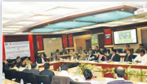
Director (HR) addressing participants of the Inter-Unit CSR Meet

In all, 60 executives from various Units including Corporate CSR team participated in the meet. The two-day meet consisted of four sessions with two sessions allotted for each day.