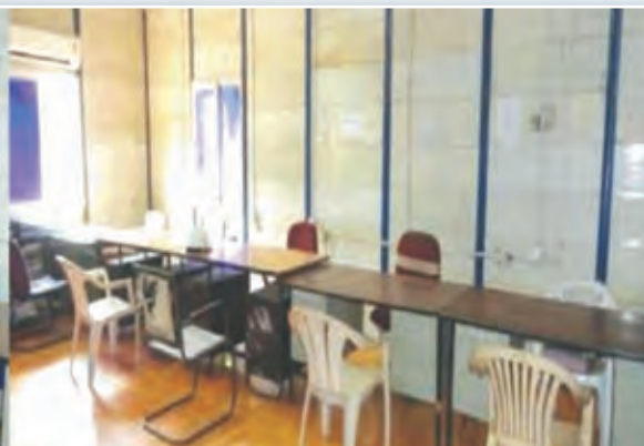
View of RINL site office (before and after its cleaning)