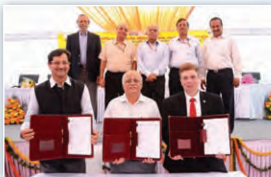
Signing of MoU between BHEL, NCF and ASI for the project 'Refurbishment of the museum Swatantra Sangram Sangrahalaya' located in Red Fort, Delhi

The museum covers an area of 17,500 square feet and is located within the double-storey barrack buildings inside the historic complex of Red Fort, Delhi. It provides a glimpse into the major phases of India's struggle for independence and covers important themes such as: (i) 1st War of Indian Independence – 1857; (ii) emergence of Indian National Congress; (iii) beginning of the Civil Disobedience Movement; (iv) Quit India Movement; and other struggles of India's journey towards independence. Over 90