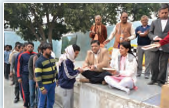
BHEL's Corporate CSR team distributing books on value education to jail inmates

Faculties of Delhi Prisons have highly appreciated this initiative and see in it an opportunity that can bring a powerful change in the lives of the inmates who have to deal with the stress of being in a jail where fights, riots, drug abuse, and suicides are not uncommon. They also look forward to many more such opportunities where BHEL can associate with Tihar projects, which the organization will be more than happy to support.