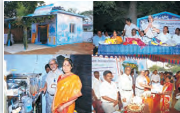
Inauguration of iJal Station in a location of Telengana State