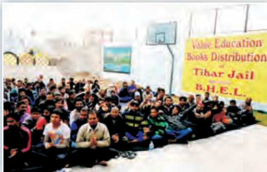
Tihar Jail inmates at the value education programme organised by BHEL, in association with ISKCON