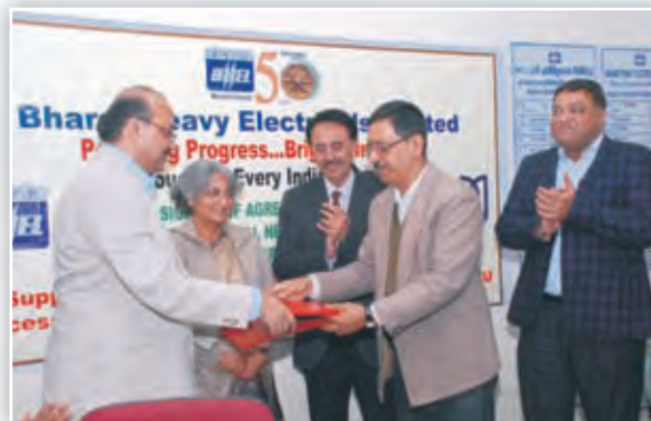
Signing of MoU between PEM, Noida & JNU for providing Bus for commuting by differently-abled students of JNU