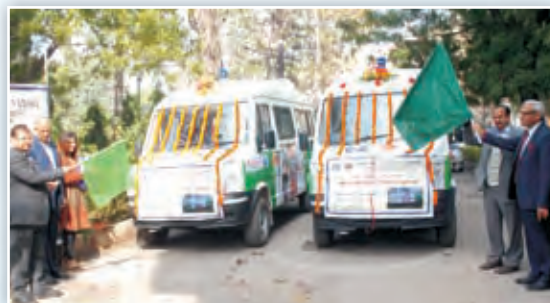
Flag-off of Mobile Medical Vans at Corporate Office, New Delhi for operation in J&K and Vizag

After providing emergency medical support/relief to the distraught people of the states of J&K and A.P (Vizag), BHEL further intensified its humanitarian relief activities in the two states by engaging the services of two Mobile Medicare Units (MMUs) – one each for the two states. The MMU project being implemented by Wockhardt Foundation are fully equipped with qualified doctors, medical teams and medicines and will provide Awareness, Diagnosis, Cure and Referral (ADCR) primary healthcare services to the people severely affected by the natural disasters that swept the two states recently.