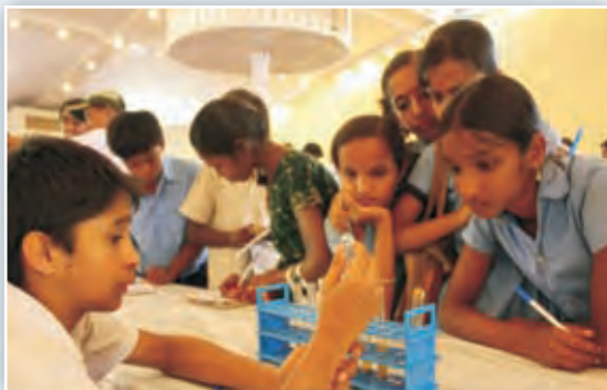
Village children getting hands-on experience on various science projects through creative & scientific learning

B HEL has embarked upon yet another noble and innovative model of imparting learning for children and teachers from the poor & underprivileged sections of the society. An MoU to this effect has been entered into with a Bangalore-based specialised agency named 'Agastya International Foundation'. This innovative CSR project initiative of BHEL, which aims to create curiosity and a scientific temperament amongst the poor school children and teachers primarily drawn from Govt.