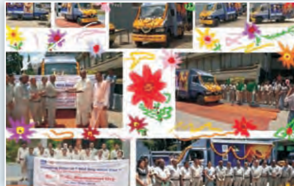
Handing over Mid-day Meal Van to Akshaya Patra Foundation by BHEL-EDN, Bangalore