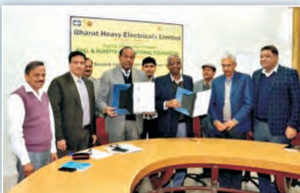
Signing of MoU between BHEL, Haridwar and Agastya International Foundation for Mobile Science Lab