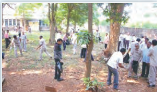
Cleanliness drive in the premises of HPVP, Vishakapatnam

BHEL-Bhopal: Cleanliness drive was started by cleaning the factory premises and removing garbage lying near the blocks/offices. Township Administration cleaned Piplani near Shastri Market which had become a dumping ground for garbage. After demolishing some dilapidated structures the entire area was cleaned and converted into a park. More than 1000 saplings were planted and the area was renamed as Shastri Park. On the auspicious occasion of 2 nd October, the park was inaugurated by Executive Director, BHEL Bhopal. At Shastri market, toilets were renovated and many other cleanliness drives were organized along with Hospital staff, Trade Unions & Associations, Jawaharlal Nehru School, Vikram School and the Kasturba College of Nursing, Habibganj.