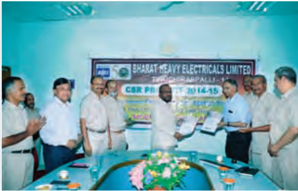
Signing of agreement between BHEL, Trichy and Agastya International Foundation for Mobile Science Lab