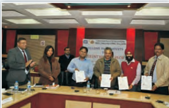
Signing of MoUs by BHEL-PSNR, Noida and BHEL-HPVP, Vizag with Wockhardt Foundation for operation of Mobile Medical Van in J&K and Vizag