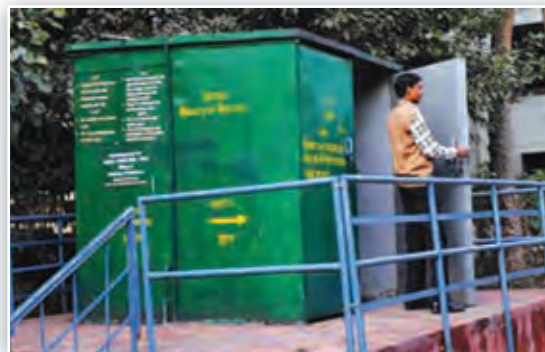
Bio-digester toilet installed by FICCI

Considering that recycling of wastes including solid wastes has been a major area of focus and concern for our country, this bio-digester technology will go a long way in successfully addressing this concern by reducing river pollution including pollution of the holy Ganga to a large extent.