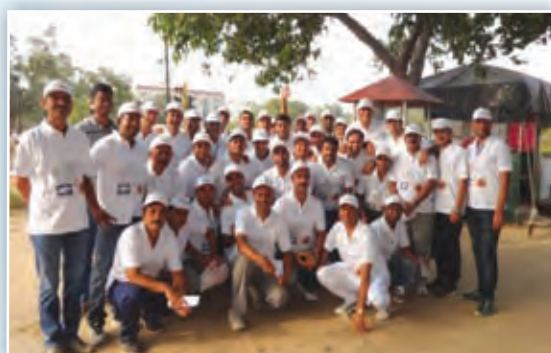
BHEL's Delhi-based Sports enthusiasts participated in the Walkathon event at Raj Path

All organizations including the Central Public Sector Undertakings (CPSUs), on 2 nd October 2014, joined the Clean India campaign by pledging their support including financial aid under Corporate Social Responsibility (CSR) initiatives. The Government has set up the Swachh Bharat Kosh (SBK) so that big and small corporations provide help to the mission by