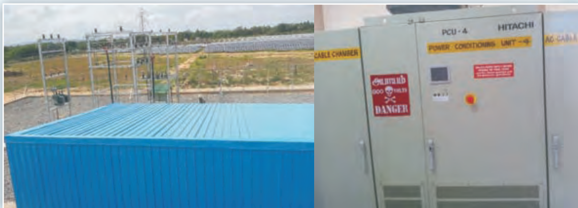
View of the 5 MW SPV power plant's control room (R) and its 11 kV grid (L)