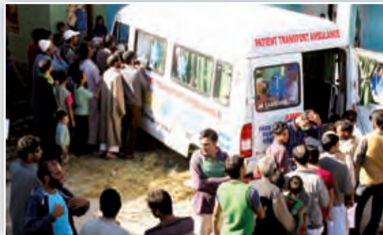
Deployment of Mobile Medical Van for the flood-ravaged people of J&K

HPVP unit was a victim of the cyclone. All the production shops and offices were damaged. Due to uprooting of thousands of trees, there was no power and water supply to the factory and township. All the roads were clogged with huge trees uprooted by the cyclone. Teams of volunteers armed with power saws and cranes got into the act and was able to clear the roads in just 3 days. On receiving SOS calls from organisations like, GVMC, APEPDCL, Post Office, SBI etc. our, HPVP team was immediately diverted for their assistance. Alternate office accommodation was arranged for Post Office. Breakfast and Lunch was arranged for the NDRF teams and police personnel who were deployed in the surrounding areas. 150 meals were also arranged for Fire Brigade Personnel.