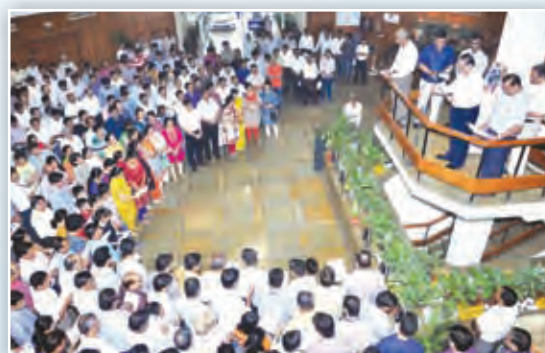
Shri B. Prasada Rao, CMD, BHEL, administered the cleanliness pledge to employees of BHEL's Corporate office, Delhi on October 2