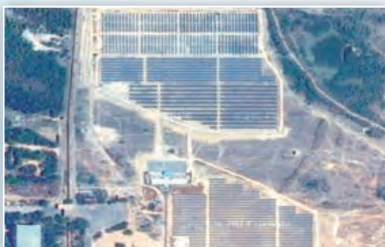
Bird's Eye View of 5 MW SPV Power plant at BAP, BHEL, Ranipet

India continues to experience shortages in energy with total deficit of 8.7% and peak deficit