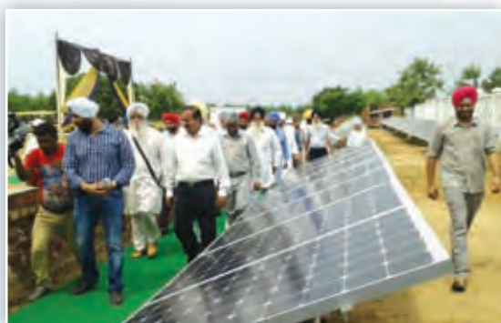
Inauguration of Solar Power Plant at Akal Academy, Dadar Sahib, Taran Taran (Punjab) by Director-HR

The Trust runs 129 low cost CBSE Schools in the rural areas of Uttar Pradesh, Haryana and Rajasthan, and the backward hilly areas of Himachal Pradesh and Punjab providing modern, value-based education to around 60,000 students. The students, mostly coming from the deprived sections of society, are admitted regardless of their caste, creed, region, religion and social status. The aim of the Trust is to build a total of 500 low cost schools to provide value-based education to all children at the village level.