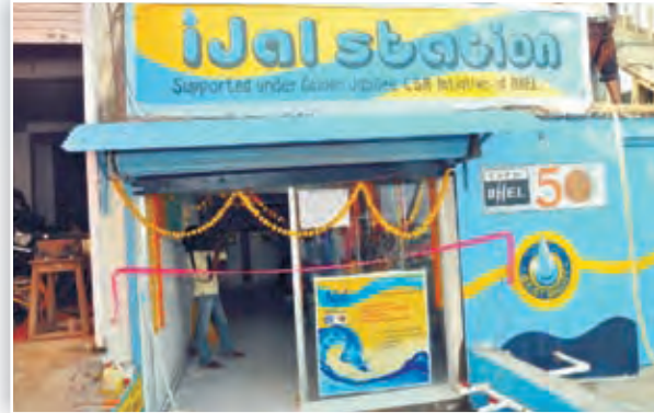
Inauguration of iJal Station in one of the villages of Bhandara