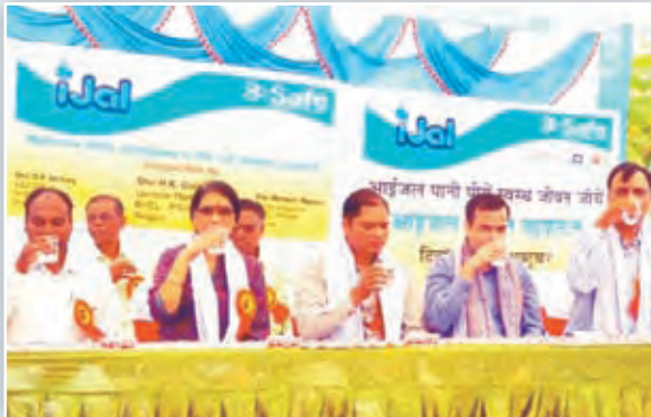
Officials & guests quenching their thirst by enjoying pure drinking water at iJal Station inaugural ceremony