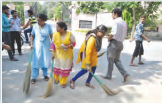
Cleaning of roads outside BHEL, Kribhco Bhawan, Noida