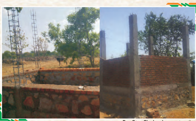
Bus Stop Shed under construction

Shri M. Khasgiwala, ED, BHEL-Jhansi inaugurated the "Bus Stop / Passengers waiting room" and handed it