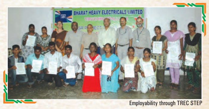
To create employability to unemployed from BPL families through TREC STEP: Rs. 12.84 Lakh.

An agreement was signed between CII Foundation and BHEL for carrying out this project. The CII Foundation in turn entered into an agreement with the Prison Authorities. BHEL provided the cost of training infrastructure and training staff. CII Foundation partnered with TREAT as the execution partner to provide the training. The WRI agreed to test the trainees and issue certificates. First batch training has been completed. It is a two year project.