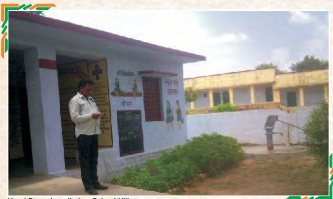
Hand Pump installed at School Village

A total of 340 rural students from economically backward communities studying in these Schools and also the under-privileged village people are the beneficiaries of this project.