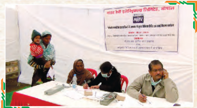
Medical camp organized at Sankal Padariya

BHEL, Bhopal under its Corporate Social Responsibility Program organized 03 medical camps during financial year 2014-15. The camps organized on 19.09.2014, 31.10.2014 and 09.01.2014 in the nearby villages of Jamunia Kalan, Amjhara and Sankal Padariya, respectively, were overwhelmingly successful.