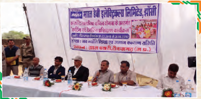
Inuguration of Cutting & Tailoring Program

providing them with financial assistance and books etc. The organization is also associated with activities like, organizing medical camps, providing drinking water facilities for the socially and economically backward communities, helping in environment protection by organizing environment awareness programmes, tree plantation, etc.