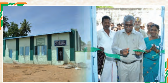
Inauguration of renovated Class Rooms Arasangudi

- BHEL Provided Play items like, Slanting Bed, Sea saw, etc. for a primary School at Udharamanagalam, Thittai at a cost of Rs.65,000/-. This has resulted in increased attendance in the primary school as the play items attracted the children towards the school.