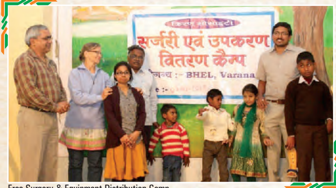
Free Surgery & Equipment Distribution Camp

Hemophilia Society, Varanasi which has been established to cater to the need of persons afflicted with Hemophilia, a life-long disorder with repeated episodes of bleeding. The centre renders emergency care needs, comprehensive treatment, psycho-social support, carrier detection, awareness programmes etc. to the extremely poor sections of the society. They are running a 17-bedded care centre in a double-storied building where persons afflicted with Hemophilia come to obtain medical and physiotherapy treatment. More than 600 persons are registered with the society for treatment.