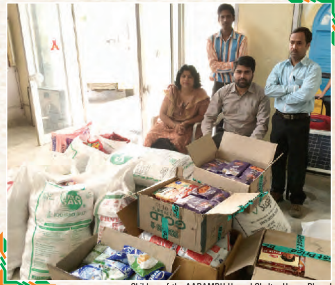
Children of the AARAMBH Umeed Shelter Home, Bhopal

The shelter home is meant for homeless children run by AARAMBH Education and Community Development Society, Bhopal. BHEL is supporting the shelter home since FY 2012-13.