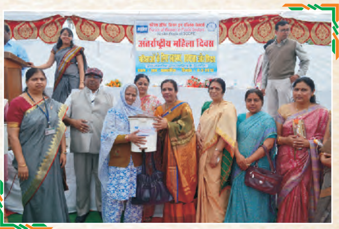
Health & Education Awareness Program at BHEL-Bhopal

On the occasion of International Women's Day on 08.03.2015, Forum for Women in Public Sector (WIPS) of BHEL conducted a program under Corporate Social Responsibility on the theme "Health, Sanitation and Education for Women". The function was organized at the BHEL adopted village of Kanha Saiyaa.