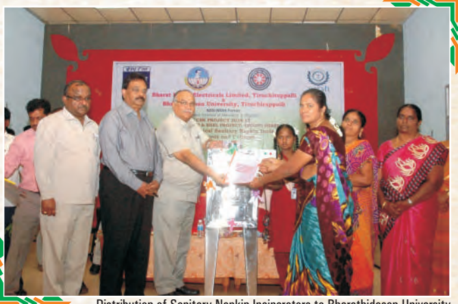
Distribution of Sanitary Napkin Incinerators to Bharathidasan University

An agreement was signed between BHEL and Bharathidasan University to provide 170 SNIs in a period of three years at a total cost of Rs. 57.18 Lakh. Through tendering process of Bharathidasan University incinerators were purchased and were issued to beneficiaries in the presence of Executive Director of BHEL and Vice Chancellor of Bharathidasan University. Girl students of fifteen Colleges and 45 Schools were the beneficiaries. In 2012-13 also, 25 such SNIs were provided to schools and colleges.