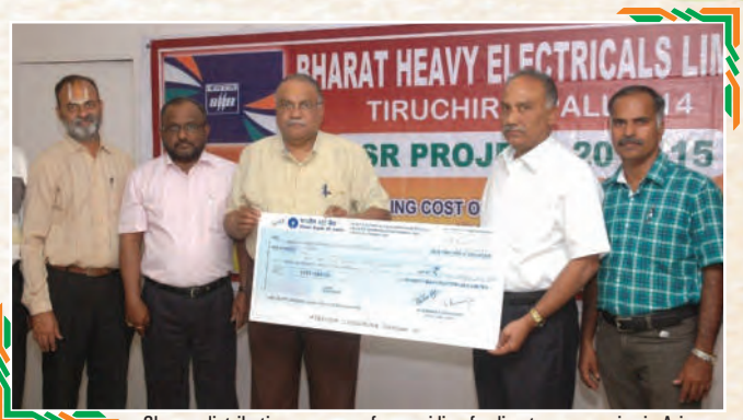
Cheque distribution ceremony for providing feeding to rare species in Arinagar

Boiler Plant Boys Higher secondary School provided with 30 kW Solar power plant