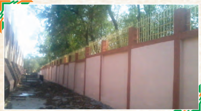
New Boundary Wall in Triveni Girls Hostel

BHEL, Bhopal under its CSR Program for FY 2014-15 completed various renovation works in the Triveni Girls Hostel. The hostel is meant for working women and female students belonging to economically weaker sections of the society.