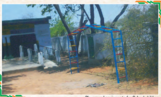
Playground equipments for School children

Kits, Footballs, Skipping ropes, Flying Discs etc. were handed over to the village school children. This is an effort to encourage the students from rural areas for joining school and also for participating in games with the motto "A Healthy Mind Lives In A Healthy Body".