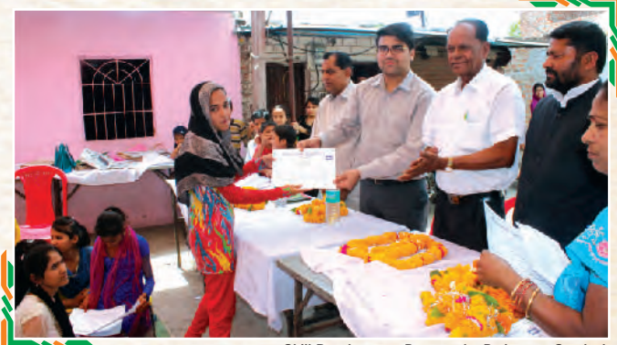
Skill Development Program by Parivartan Sandesh

Parivartan Sandesh conducted Skill Development Program on "Jute Handicraft". Beneficiaries of the program were female slum dwellers of the gas tragedyaffected slums of Bhopal. Total number of participants in the program were 100.