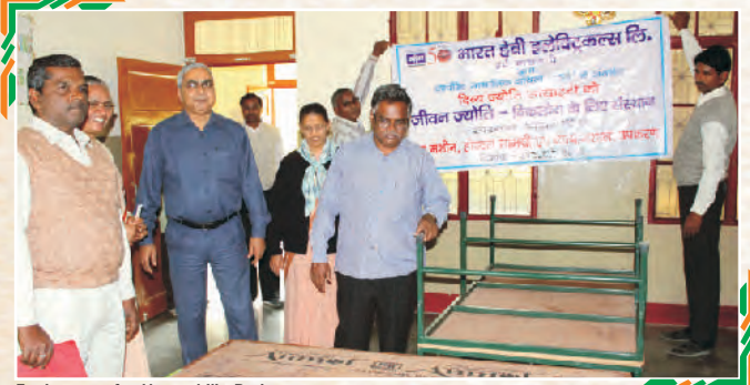
Equipments for Hemophilia Patients

BHEL-HERP, Varanasi has provided Equipment for 'Multi setup expansion of Ashadeep', a psycho-social Hemophilia Care Centre operating under the aegis of