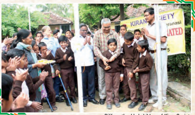
Differently-abled children of Kiran Society

A CSR project of HERP, Varanasi for providing sanitation facility in the following State Government run schools in and around the vicinity of the Unit is under execution.