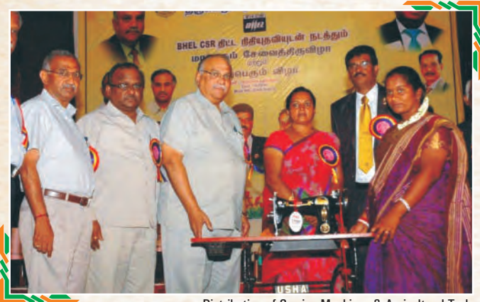
Distribution of Sewing Machines & Agricultural Tools

BHEL signed an agreement with the Lions club of Trichy. Procurement of sewing machines, agricultural tools and selection of beneficiaries was done by the Lions club. A grand function was held and 174 of persons were given sewing machines and 150 farming labourers were given agricultural tools.