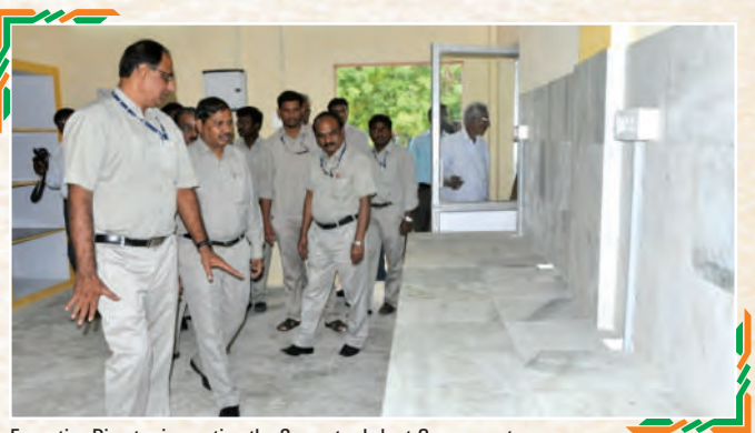
Executive Director inspecting the Computer Lab at Government Higher Secondary School, Kodaikal Village.

Govt. Hr. Sec. School located at Kodaikal Village in Vellore district. This is a state government run Higher Secondary School with a strength of around 850 students