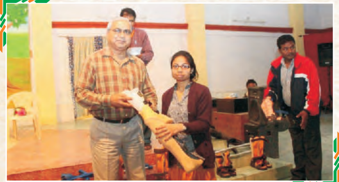
Distribution of Artificial Limbs to Persons with Disabilities (PwD)

Support to differently-abled children through NGO 'Kiran': BHEL-HERP, Varanasi supported 'Kiran', an NGO located at Village: Madhopur, PO: Kuruhuan, Varanasi, who are engaged in the service of Differently-abled/Physically Challenged children, numbering 10-15. The children are affected by post-polio paralysis,