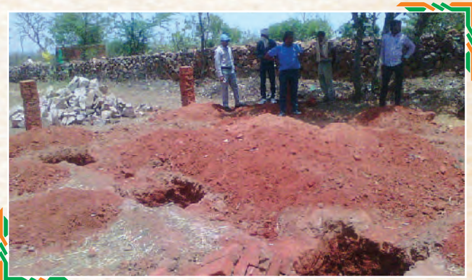
Construction site for Bus Stop Shed

Implementation of the Corporate Social Responsibility Project "Providing Bus Stop at nearby villages Junctions" near pathari (On the way from Chakarpur