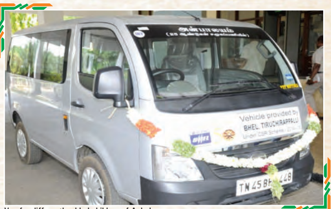
Van for differently-abled children of Anbalayam

Anbalyam is a home for wandering mentally ill, run by Anbalalyam Trust. Now, Anbalaym is home for 120 such persons. The agency picks up the mentally ill from the streets and provides medical treatment, food shelter, etc. and rehabilitation to them. A few of them have rejoined their families after being cured of their mental illness. The agency also goes around the city and provides food