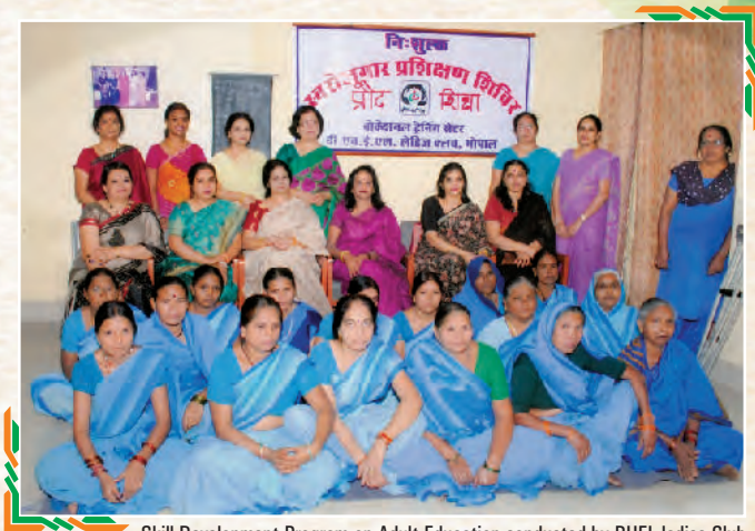
Skill Development Program on Adult Education conducted by BHEL ladies Club

BHEL Ladies Club conducted Skill Development Programs of "Dholak Learning, Beautician Course, Rangoli, Madana, Adult Education and Spoken English". Various beneficiaries for the program were female participants belonging to weaker sections of the society. In all, there were 140 participants in the program.