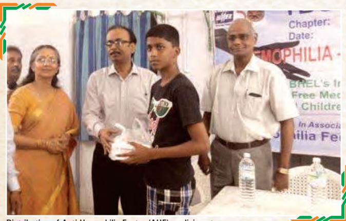
Distribution of Anti Hemophilic Factor (AHF) medicines to Hemophilia affected children by Director(HR)

BHEL-TBG, in association with Hemophilia Federation (India), is undertaking a Pan India CSR project called "Heal A Soul 2" to provide free of cost Anti-Hemophilic Factors (AHFs) to 720 poor children suffering from Hemophilia and Prevention of Hemophilia - support for Carrier Detection (CD) and Prenatal Diagnosis (PND) of 120 women from Hemophilic background. This corporate-aligned CSR project of BHEL would cost Rs. 3.2 Crore and would be implemented during 2014-15, 2015-16 and 2016-17.