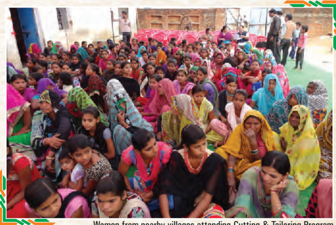
Women from nearby villages attending Cutting & Tailoring Program

providing them with financial assistance and books etc. The organization is also associated with activities like, organizing medical camps, providing drinking water facilities for the socially and economically backward communities, helping in environment protection by organizing environment awareness programmes, tree plantation, etc.