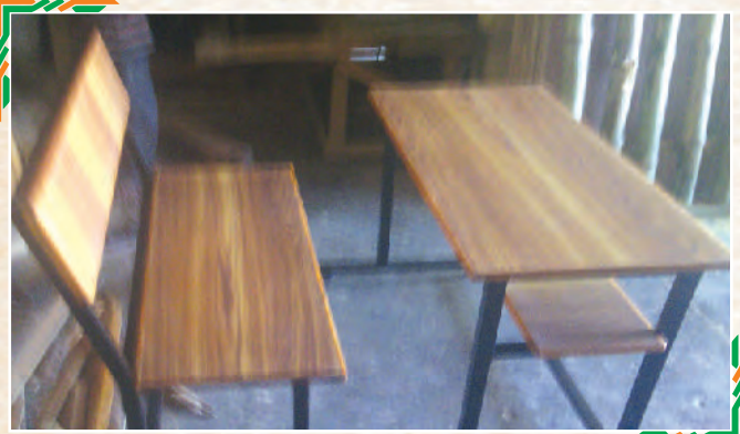
Desk & Benches for School children

A total of 150 students from socially and economically weaker sections and rural backgrounds are studying in these schools.