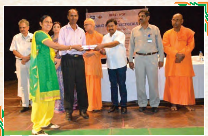
Distribution of projector cum Laptops

TBG-BHEL in association with Ramakrishna Mission, Delhi had undertaken "BHEL-Jyoti CSR project " for distribution of "Projector-cum-Laptop" Rs. 40 Lakh to 44 Government Schools each in Bhopal and Delhi.