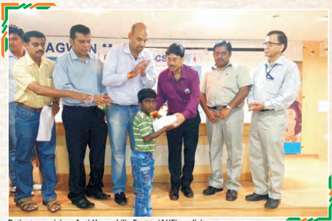
Patients receiving Anti Hemophilic Factor (AHF) medicines

Hemophilia Society and Physiotherapy equipments to Bangalore Hemophilia Society.