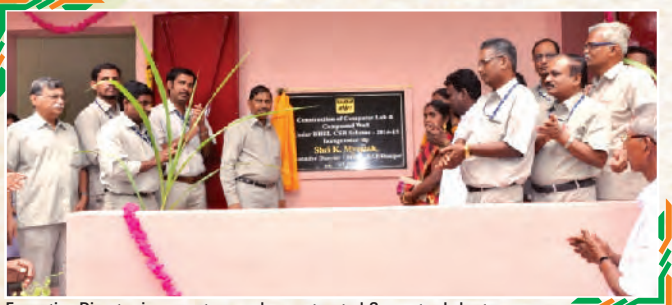
Executive Director inaugurates newly constructed Computer Lab at Government Higher Secondary School, Kodaikal Village.

approx. 2500 girl students from under-privileged sections of the society study. The compound wall was in a damaged/dilapidated condition making the girl