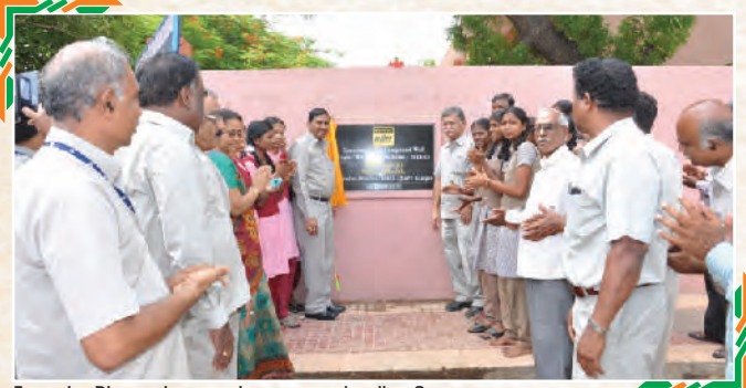
Executive Director inaugurating compound wall at Government Girls Higher Secondary School, Walajha

approx. 2500 girl students from under-privileged sections of the society study. The compound wall was in a damaged/dilapidated condition making the girl