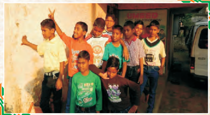
Children of the AARAMBH Umeed Shelter Home, Bhopal

Bhopal for meeting their requirement of food and nutrition.