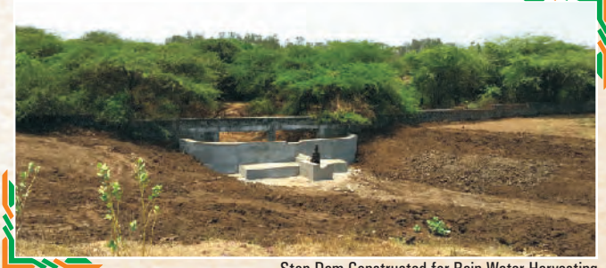
Stop Dam Constructed for Rain Water Harvesting

BHEL, Bhopal under its Corporate Social Responsibility Program constructed stop dam for rain water harvesting near Golf Course in Sports Complex which is used mostly by outsiders.