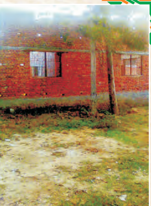
Construction of Community Hall in progress