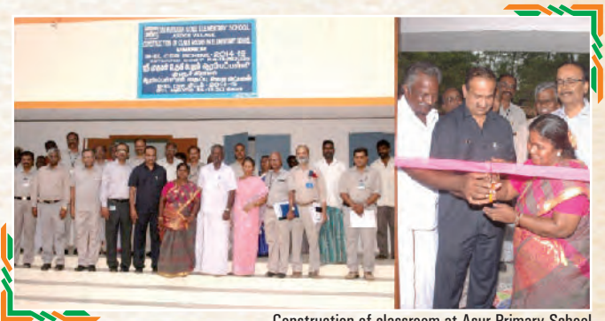
Construction of classroom at Asur Primary School

The BDO of Thiruverumbur and elected president of Thirunedungulam forwarded the request of the Head