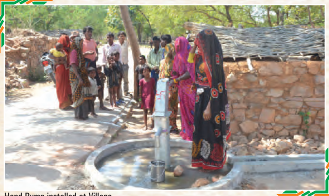
Hand Pump installed at Village

The water hand pumps were formally handed over to the community. During the programme, the CSR committee members interacted with the rural public