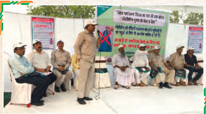
Awareness program held at Piplani Market

On the occasion of World Environment Day on 05.06.2015, 02 programs on the theme "Awareness Program on the ill-effects of Polythene" were organized. The programs were organized on 04.06.2015 and 06.06.2015 in the Piplani and Barkheda markets of BHEL-Bhopal.