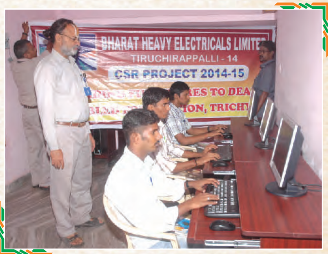
Provision of Furniture and Invertor

project milestone activities and payment schedule. The BDO was the nodal agency for this project. The Well was dug out and a pump set installed for pumping water to the adopted villages. The total Cost of the Project is Rs. 12.69 Lakh.