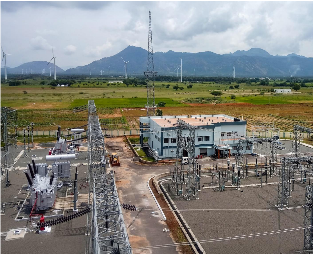
400/ 110 kV TANTRANSCO Thappagundu Air Insulated Substation (AIS) executed by BHEL in Tamil Nadu