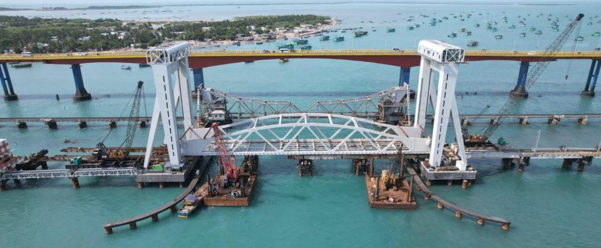
New Pamban Bridge - BHEL's Welding Research Institute contributed critical welding expertise to its construction