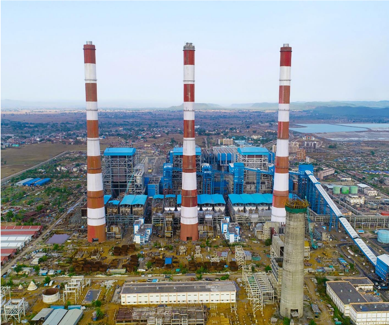
BHEL successfully commissioned 3x660 MW North Karanpura Super Thermal Power Station in Jharkhand