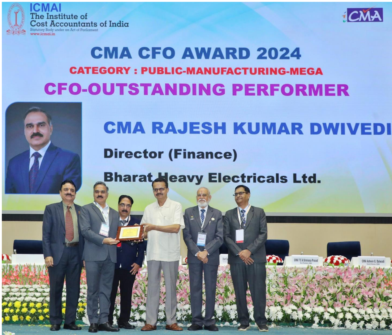
CFO Outstanding Performer Award