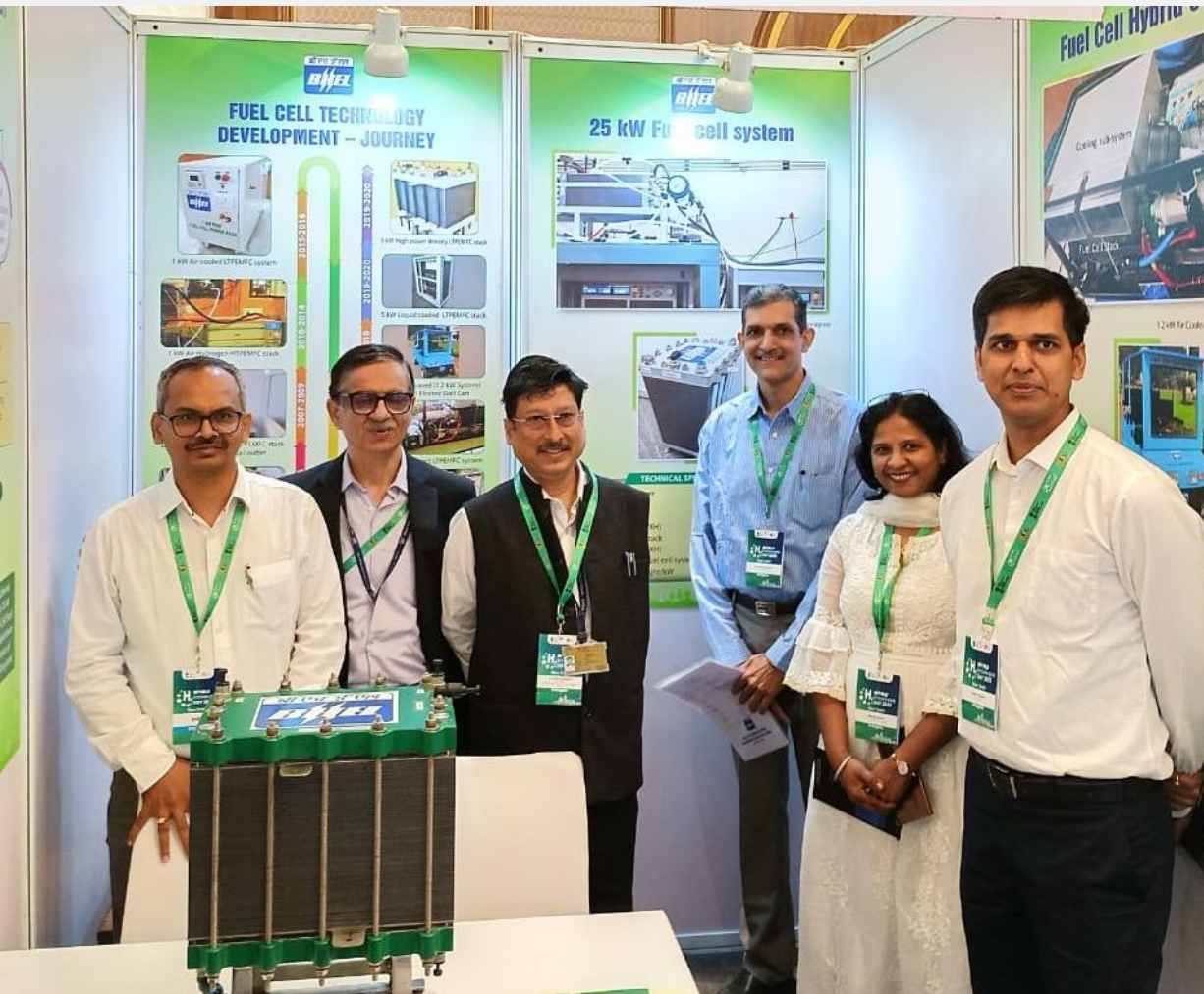
BHEL showcased its 25 kW Fuel Cell stack during 'World Hydrogen & Fuel Cell Day' event