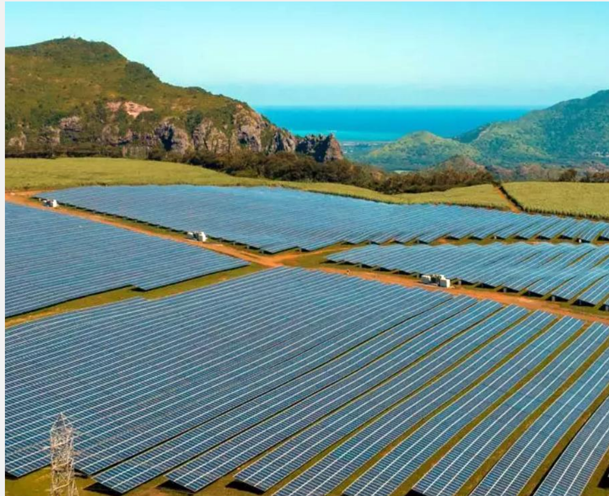
Commissioned 8 MW (AC) Tamarind Fall Solar PV Farm in Henrietta, Mauritius