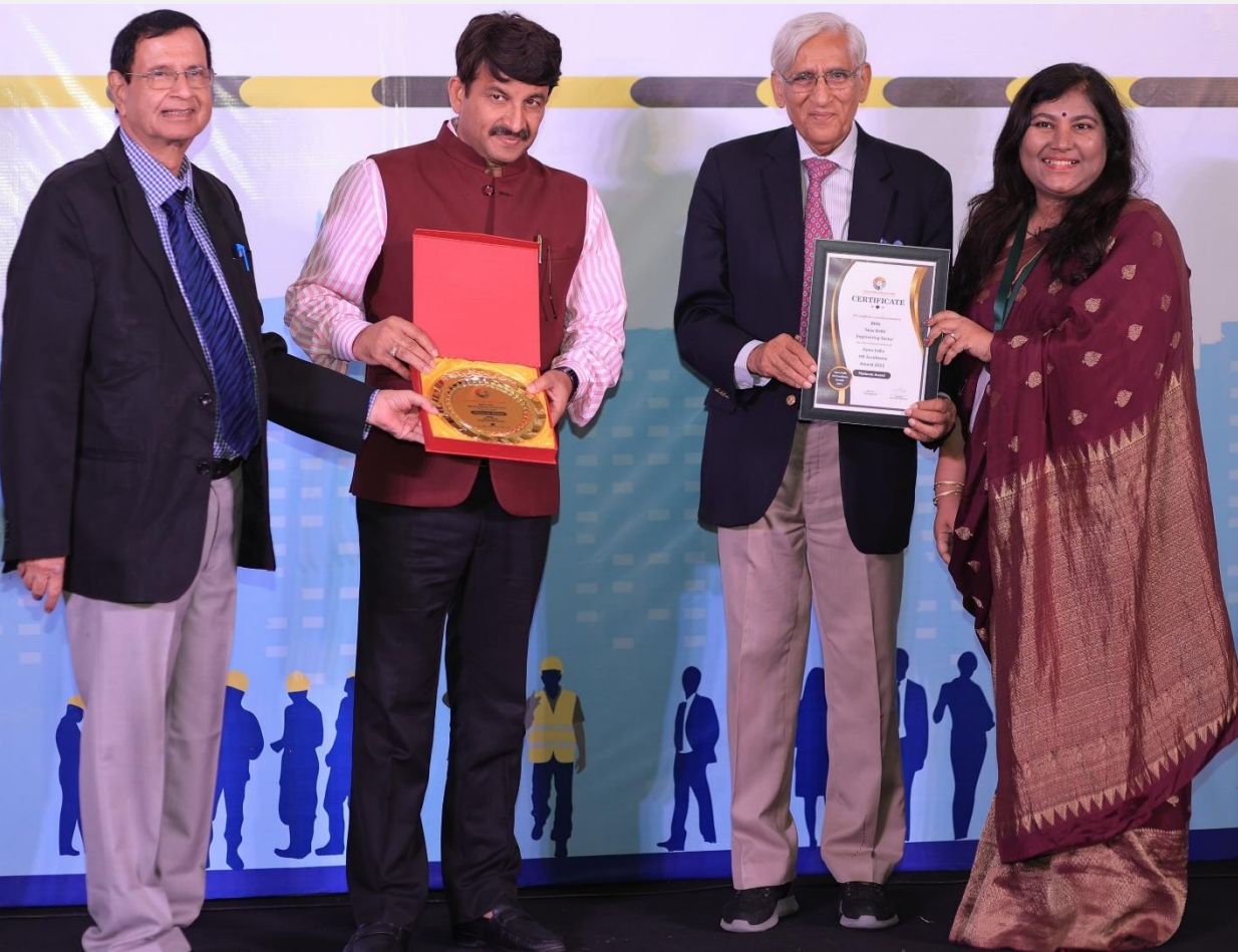
Platinum Award for HR under 'Apex India HR Excellence Awards 2023' and the Gold Award under the 'Apex India Occupational Health & Safety Award 2023'