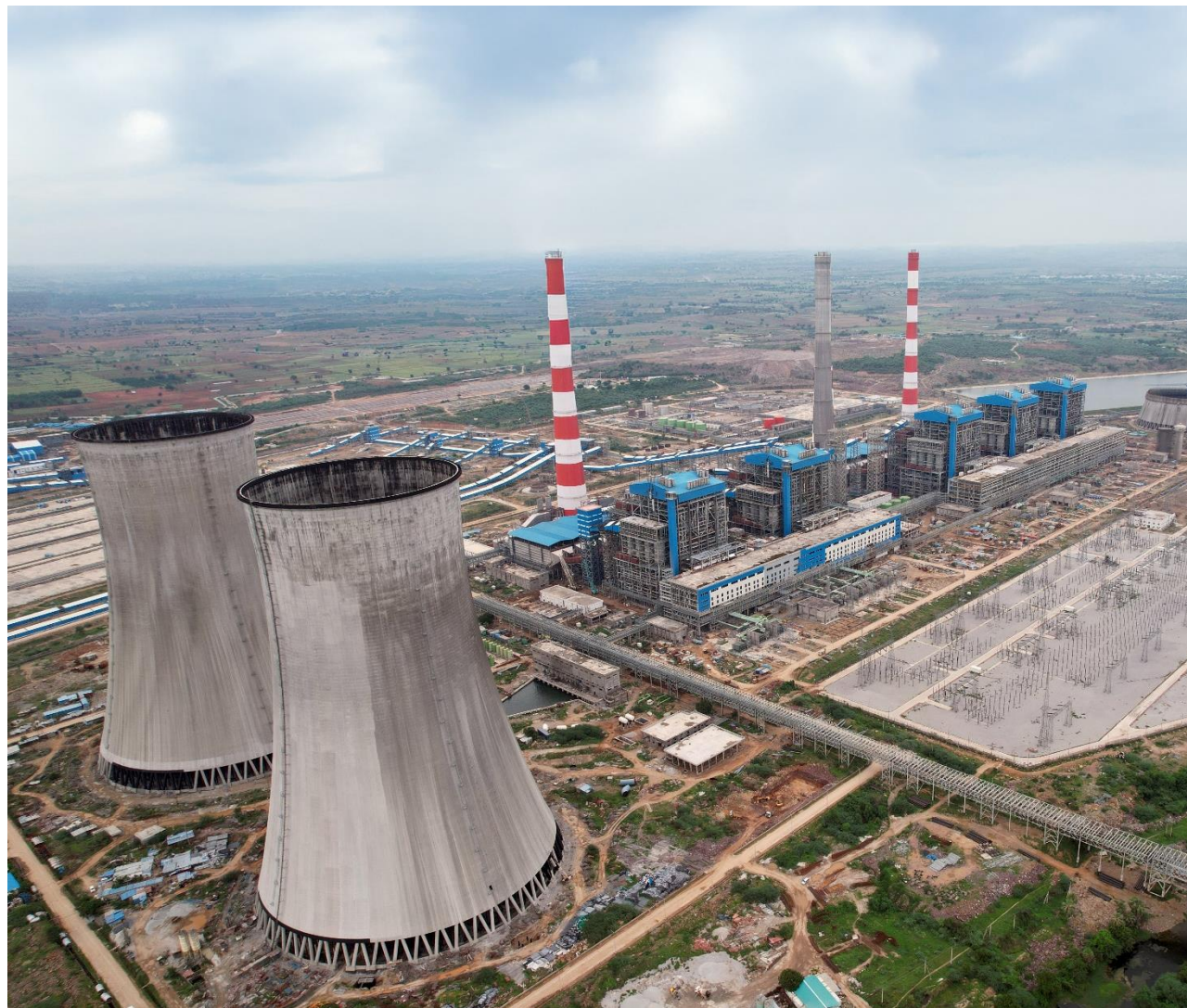
5x800 MW Yadadri, Telangana