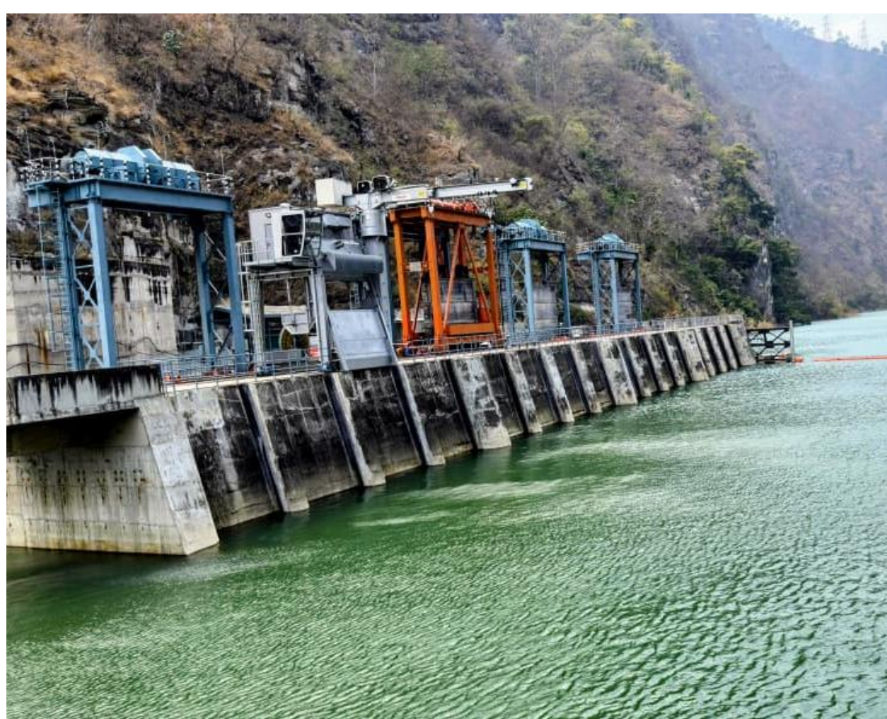
Punatsangchhu-II HEP, Bhutan