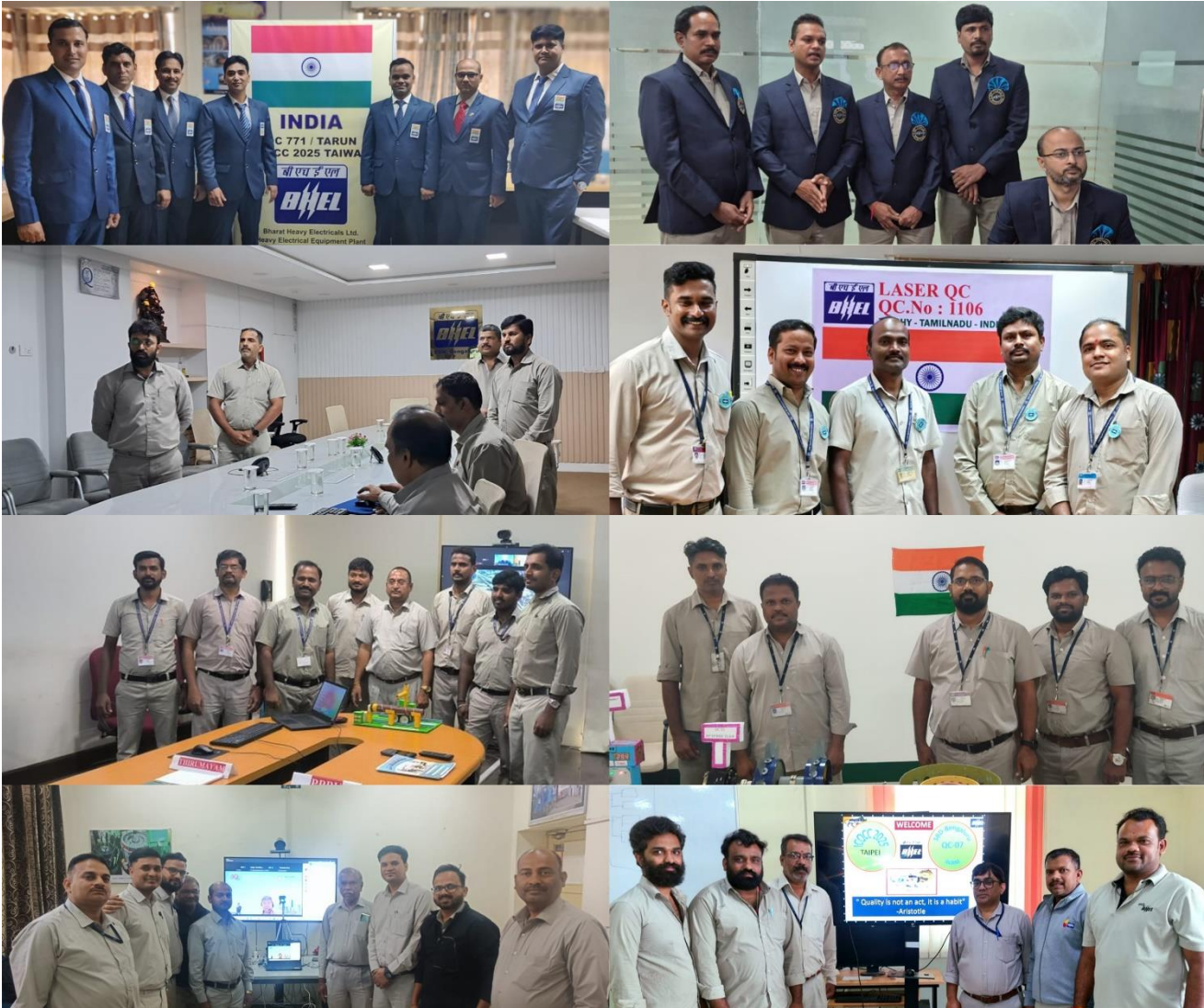
Quality Circle teams of BHEL won the prestigious Gold Awards in ICQCC-2025