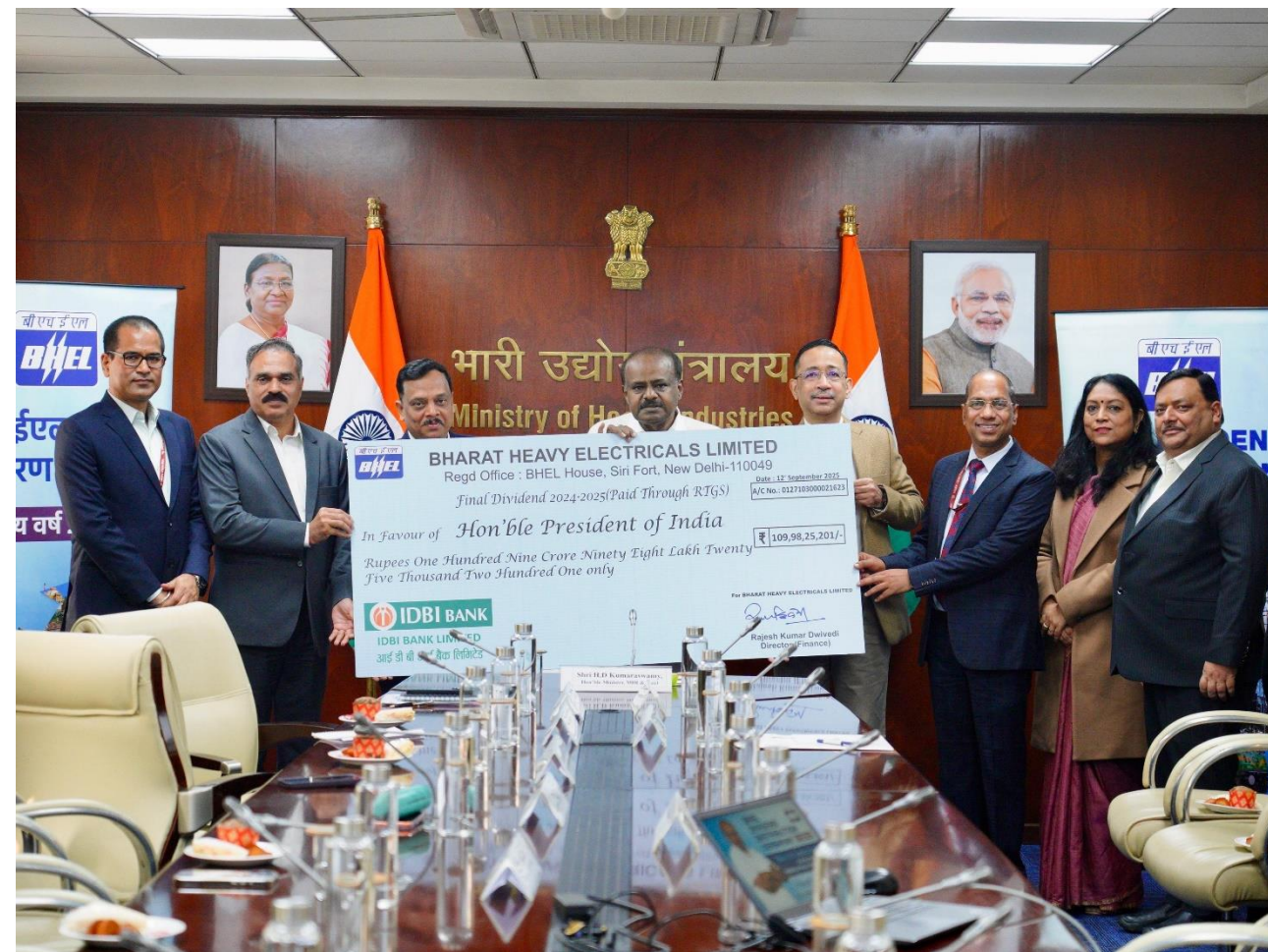
Shri H. D. Kumaraswamy, Hon'ble Union Minister of Heavy Industries and Steel accepting Rs. 109.98 crore dividend cheque from CMD, BHEL