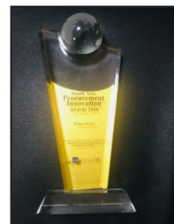
Winner of South Asia Procurement Innovation Award 2016 by World Bank