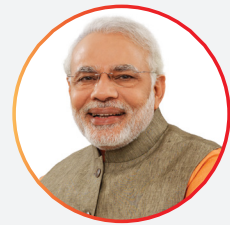
Sh. Narendra Modi Hon'ble Prime Minister

“ The Government is committed to curbing corruption. One of the key aspects of this objective is to minimise Government's human transactional interface. ”