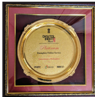
Digital India Platinum Award 2018 for 'Exemplary Online Service' by MEITY